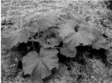
The little plant that started it all.