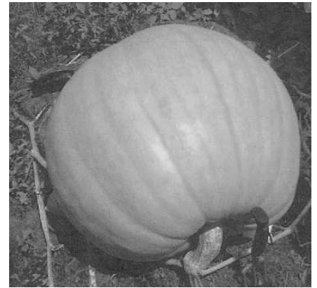
The end result

The story of the big pumpkins. Actually there were three over in the gardens. Ross bought the seeds in Melbourne, called ' Atlantic Giants ' 6 seeds for $15. Said to grow to 318 kilos.