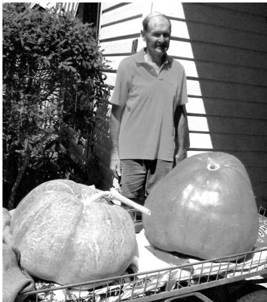
Ross with the two survivors.